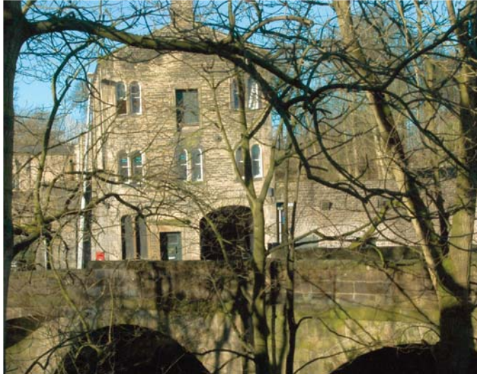
Higherford Mill from Pendle Water and the footpath that connects Pendle Heritage Centre with the Mill.

Higherford Mill was built by Christopher Grimshaw as a spinning mill in 1824, close to water to harness it for powering the looms. Water was taken from the river from a weir, half a mile upstream, and channelled to a mill dam or lodge, and then through sluices into the rear of the Mill, onto a breast-shot waterwheel. In 1832 steam power was introduced to supplement the water power and the square stone chimney was built, with a flue running up the hillside to carry the smoke away. This continued use of water power in conjunction with steam power until the late 19th C is rare, and was one of the reasons why the building was spot listed in 1996. The Mill will be open with guided tours commencing at 11am and 2pm each day, including visits to the Artists' Studios.