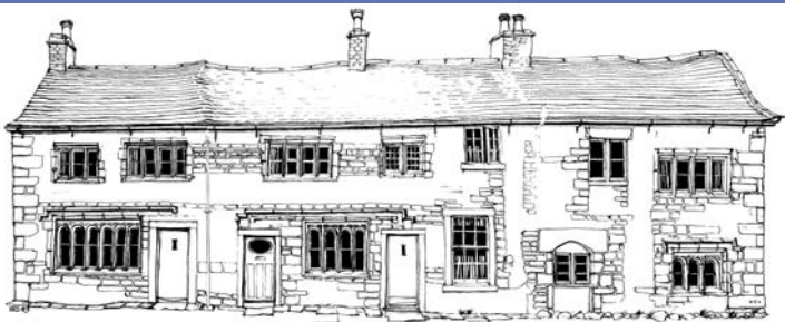
The Fold, Higherford: This 16th century farmhouse has been converted into 4 cottages. From an original drawing by Kit Smith.

Heritage Trust for the North West is a registered Building Preservation Trust and was established in 1978 as a charity and company limited by guarantee (no. 508300). The Trust seeks to find new appropriate uses for historic buildings at risk and encourages good design and craftsmanship. It has retained some of the buildings it has restored deriving rental income from them. Others are open to the public forming a network of historic places to visit. Pendle Heritage Centre, established in 1977 is one of the Trust's flagship projects, attracting over 100,000 visitors per annum.