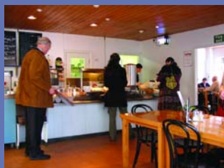
The Garden Tea Room.

The Tea Room overlooks the 18th C. Walled Garden and is open from 10am for morning coffee, lunch and afternoon tea. It specialises in home-cooking and Lancashire dishes. Vegetarian options are always available.