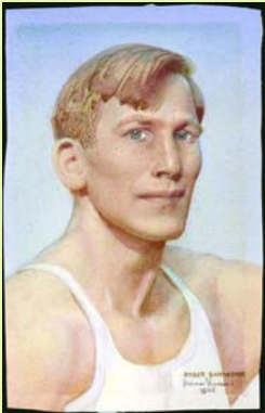
Sir Roger Bannister