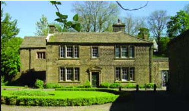
The 18th century Georgian extension.