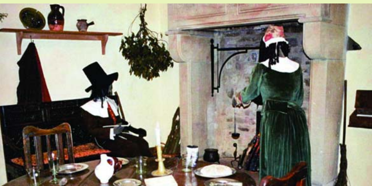
The Hearth setting in the Museum.