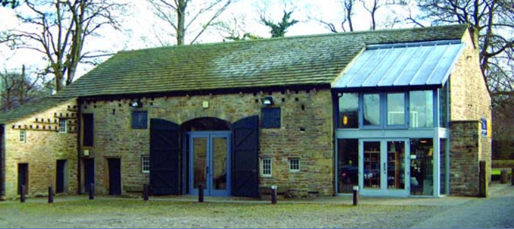
Park Hill Barn and Pendle Arts Gallery.