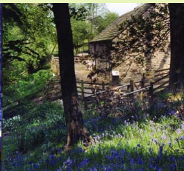
The Cruck Frame Barn from Bluebell Wood.