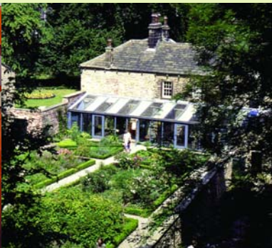
HRH The Prince of Wales in the Garden Museum on his visit to Pendle Heritage Centre, 24 October 2003.