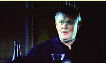
Roger Nowell, the Examining Magistrate at the Witches Trials

The main exhibitions are in the old part of the house which still evokes the atmosphere of the 17th century.