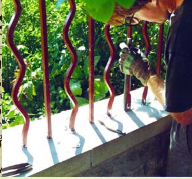
Installation and restoration of railings at the front of Park Hill.

Discover the origins of the ancient farmhouse known as Park Hill, which has been carefully restored using traditional building skills to provide visitors with a vivid insight of how this historic house has developed and been adapted from the 1400s to the present day, showing the architectural styles of each period.