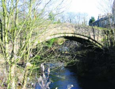
The old Pack-horse Bridge in Higherford.