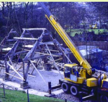
The Cruck frames being erected at Park Hill