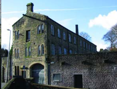
Higherford Mill acquired by the Trust in 1999.