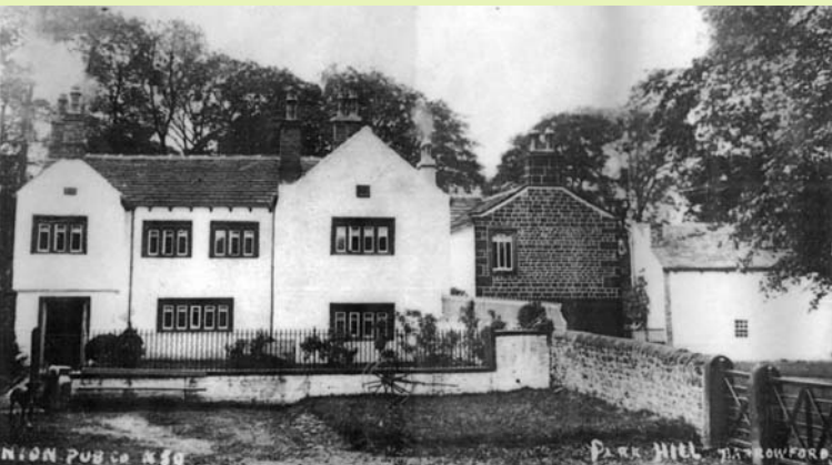
Park Hill and Barn c1900 when both buildings were limewashed.

Situated beside an ancient crossing of Pendle Water, this group of attractive Listed Grade II farm buildings and walled garden, only a mile from the M65, offers the ideal day out for the whole family, and the perfect base from which to explore the Pendle area either on foot or by car.