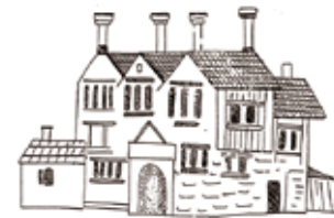
The Jacobean Hall built in 1606; parts survive at the rear, and incorporate the early Priory.

The Trustees immediately set about engaging Heritage Trust for the North West, a regional Trust based in East Lancashire with many years experience of managing historic properties, and together, with help from The Friends, The Lytham St Annes Civic Society and Lytham Heritage Group, they have begun to raise the profile of the Hall as a potential major visitor attraction in the North West, and focal point for the community.