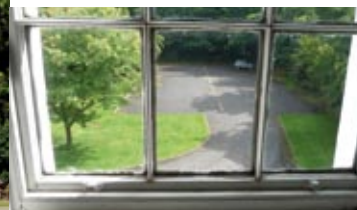
120 Sash windows require repair.

Both Trusts have been severely handicapped in developing the Hall as it came without any Endowment or revenue support. Priority had to be concentrated on income generating activities in particular the development of the West Wing Conference Centre.