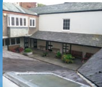
The courtyard of the Jacobean Hall. This is the oldest part and is in urgent need of repair to make it once more the hub of the Hall.

Hall remained a hidden gem. In 1996 GRE decided to dispose of the Hall. With very little time to act, Lytham Town Trust and the Friends of Lytham Hall launched a remarkable campaign supported by many voluntary organisations and local people to acquire the Hall for the community and along with a very generous donation of £1 million from British Aerospace, the Trustees achieved their objective in February 1997.