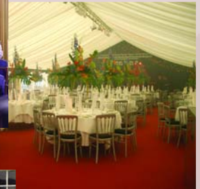
A corporate event in the grounds