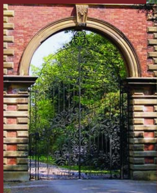
The Country Park in May