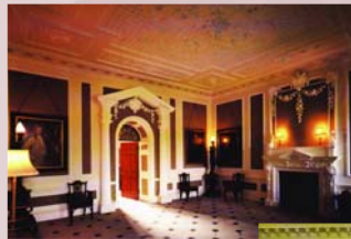
Main Entrance Hall

The Clifton family had been in the area since the 12th century and purchased the Manor of Lytham in 1606. They were a colourful family and lived in considerable style. Strong Catholics, they were accused of conspiracy during the Lancashire plot to restore James II but were later acquitted. The many fine family portraits, furniture and original fittings still convey the feeling of a private residence.