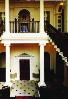
Main Staircase with Jupiter above the stairwell