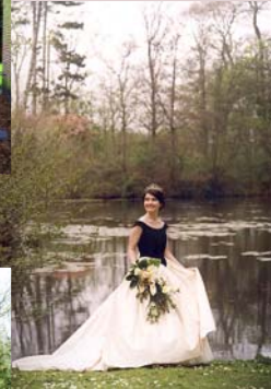
The Lily Pond