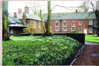
The West Wing Conference Centre