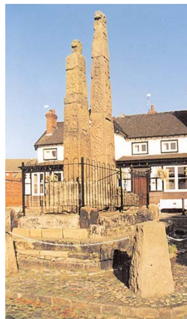
(above) Stone crosses, Sandbach, Cheshire.