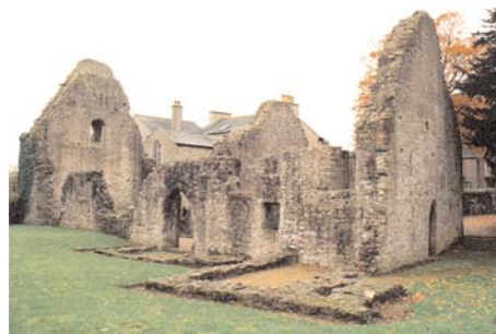
Three properties managed by the Heritage Trust for the North West on behalf of English Heritage. (top) Sawley Abbey, Nr Clitheroe. (above) Warton Rectory, Nr Carnforth.