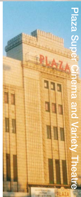
Plaza Super Cinema and Variety Theatre