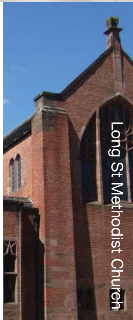
Long St Methodist Church