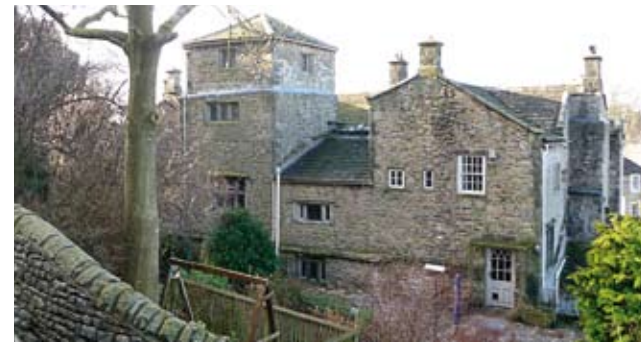
View of the North Range and rear garden

Reuniting The Folly In February 2010 an opportunity arose for the Trust to purchase the North Range, supported by a loan from the Architectural Heritage Fund. The Trust was then able to reunite the two halves of The Folly and will open it in its entirety for all to enjoy, following restoration and refurbishment.