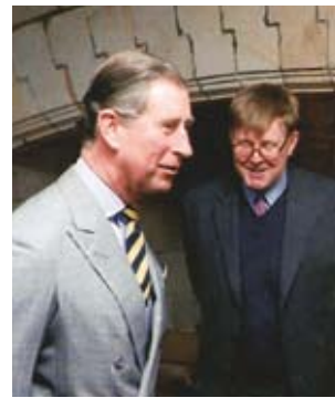
HRH The Prince of Wales with Alan Bennett, Trust President, at the opening of The Folly

The building stands on the original main road into the town and undoubtedly was built to make an impact. It had extensive gardens across the street with a garden tower, now demolished. In the 18th century the new Toll road became the main highway into Settle, leaving The Folly in a quiet corner of the town.